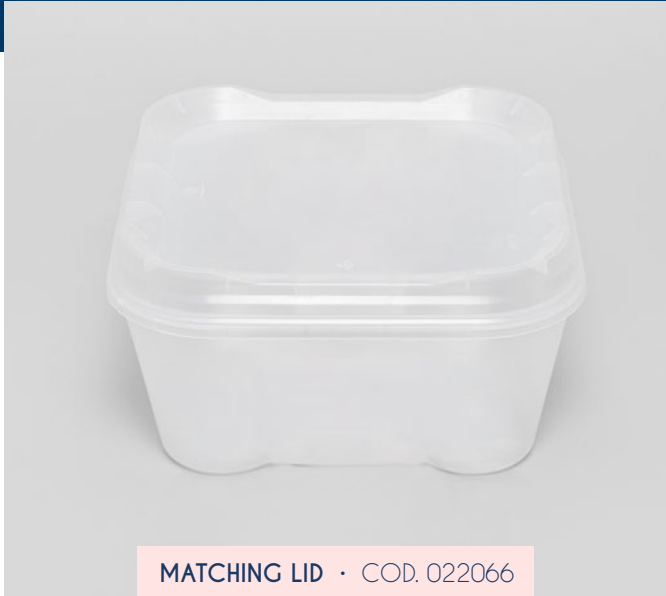
MATCHING LID · COD. 022066